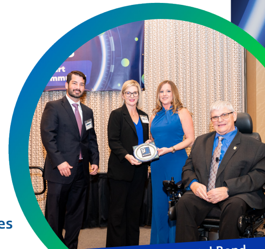
Workforce Solutions Coastal Bend, 2022 Goodwill Community Partner of the Year